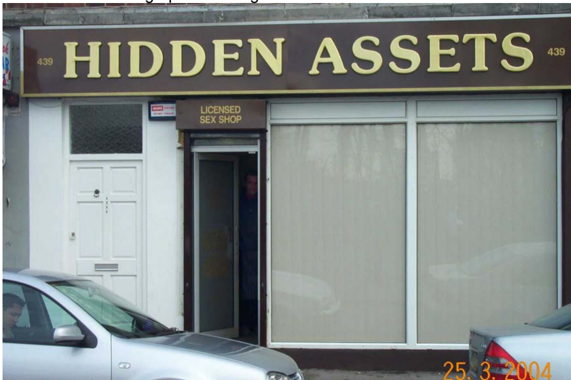
Photograph of frontage of 439 Millbrook Road West